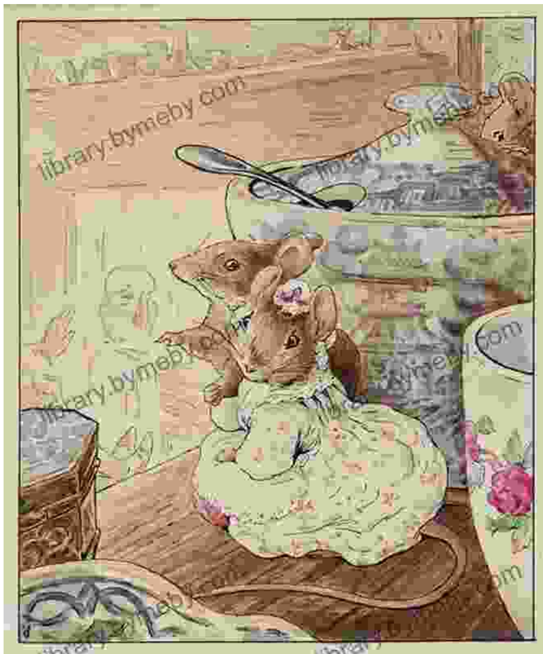
The Birth of Peter Rabbit

Beatrix's artistic inspirations included the Pre-Raphaelite painters, such as Edward Burne-Jones and John Everett Millais. She admired their intricate brushwork and their ability to create scenes that were both beautiful and evocative. She was also influenced by the Japanese art she encountered at the Victoria and Albert Museum, which impressed her with its simplicity and elegance.