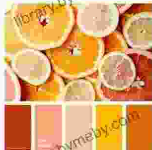
Color Palette #4293

Your Etsy brand is the cornerstone of your business, reflecting your unique style and values. In this chapter, we'll unveil the secrets of creating a compelling brand that resonates with your target audience. From choosing the perfect shop name to designing an eye-catching logo, we'll help you define your brand's essence and establish a strong online presence.