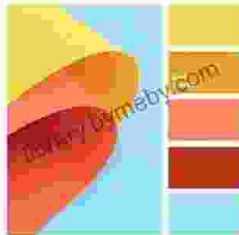
Color Palette #4295