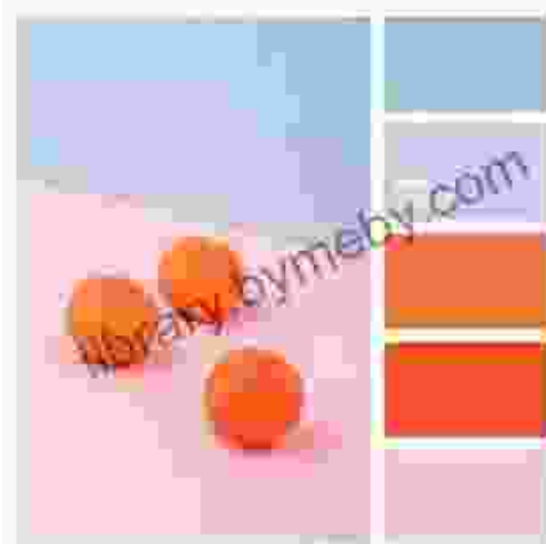
Color Palette #4296