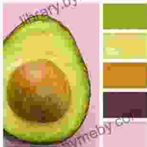
Color Palette #4294