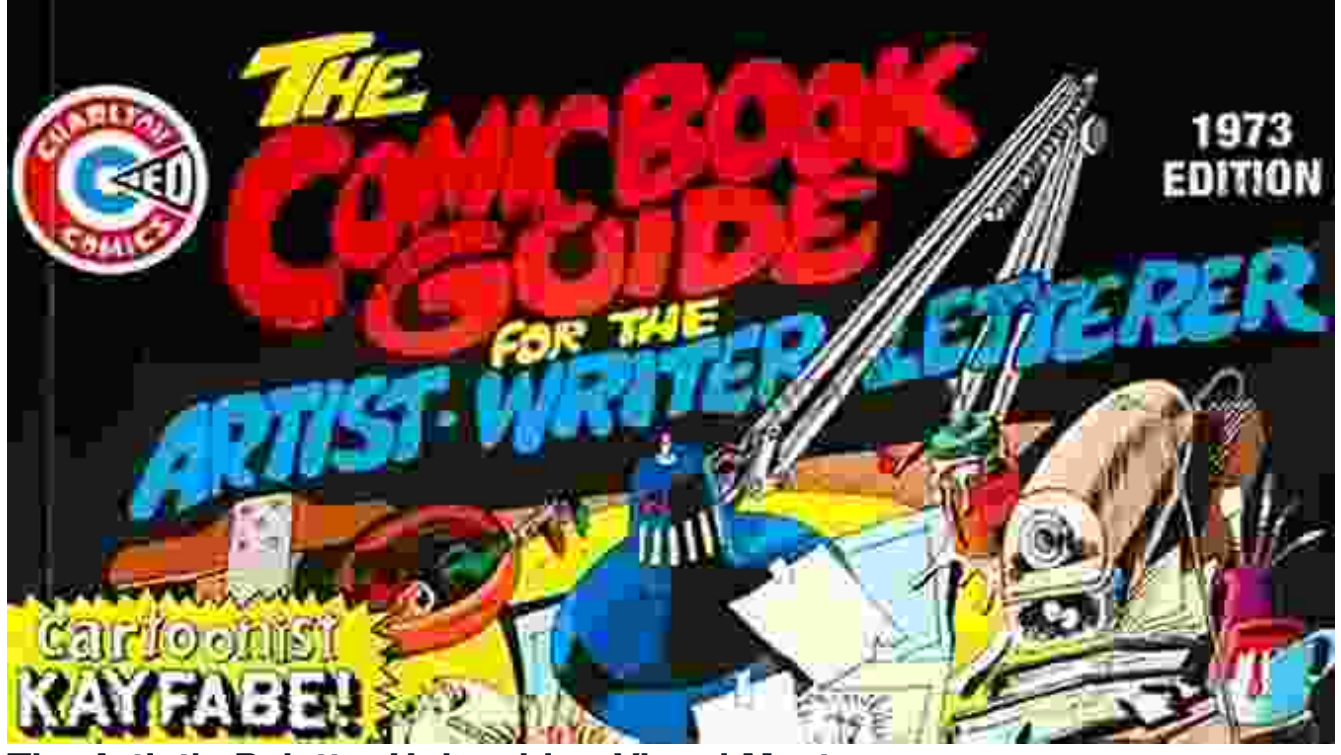
The Artist's Palette: Unleashing Visual Mastery

As an artist, you're the architect of your comic book's visual identity. This guidebook delves into the fundamentals of comic book art, providing you with the tools and techniques to captivate readers with stunning visuals.