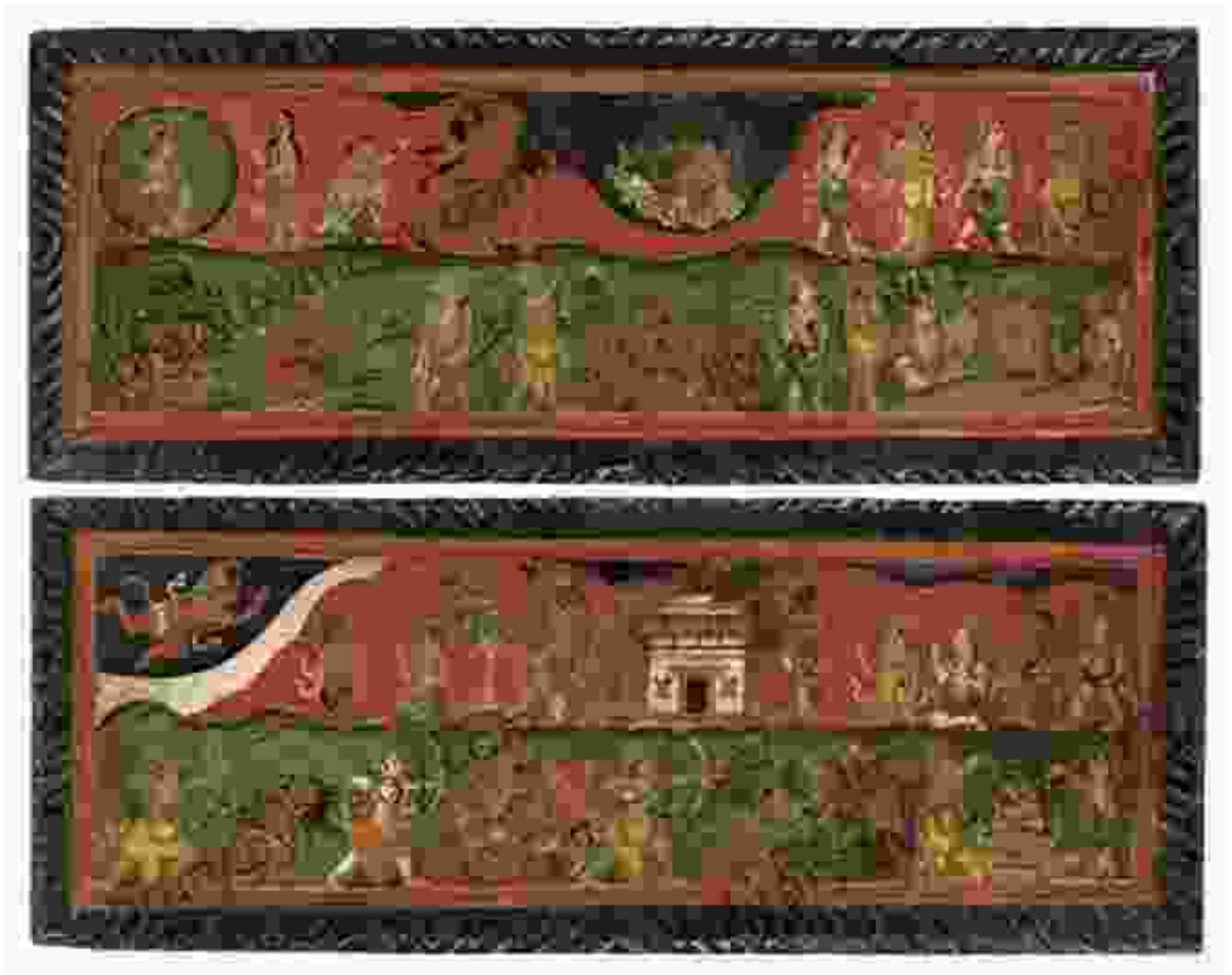
Unforgettable Characters that Linger in the Heart

The Heart Kingdom is populated by an array of unforgettable characters who each embody unique virtues and challenges. Among them is the spirited heroine, Mary-girl, whose unwavering optimism and resilience inspire those around her. She embarks on a quest to find her missing father, encountering a cast of eccentric characters along the way.