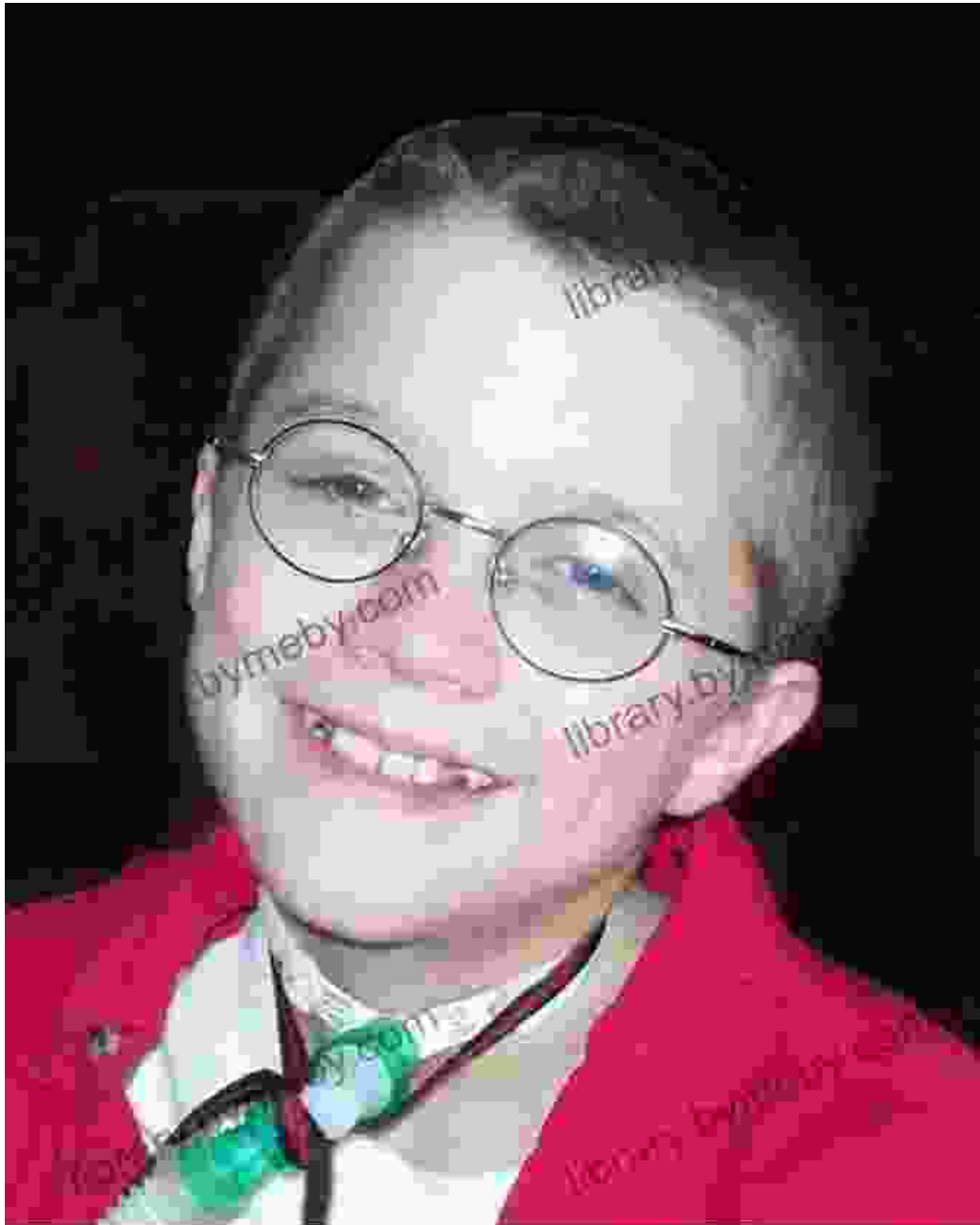
The Boy Who Inspired Millions