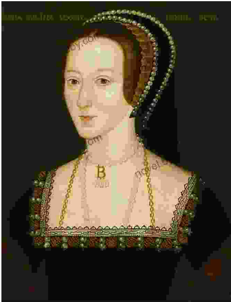
Portrait of Anne Boleyn