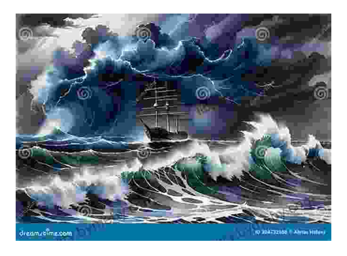
Symbol of Salvation and Redemption

The journey depicted in these paintings is often fraught with challenges and obstacles, yet the lifeboat persists, carrying its passengers towards an unknown destination. This symbolism encourages us to embrace the unknown, to persevere through adversity, and to trust in the power of hope that guides us along the way.