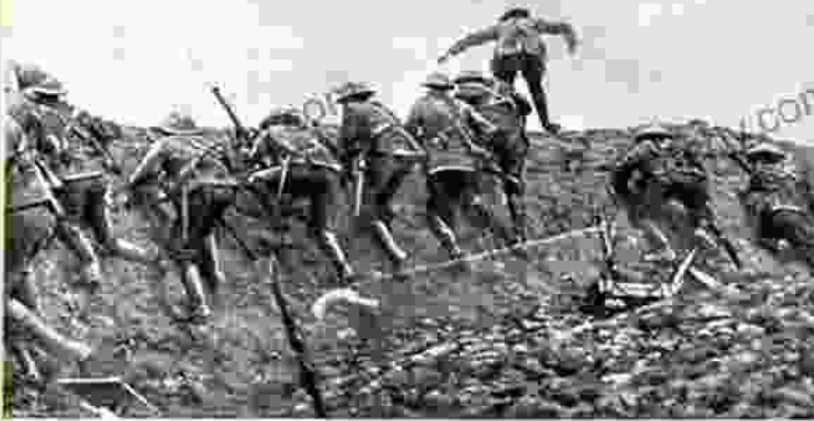
"OVER THE TOP" AT THE BATTLE OF THE SOMME

The American Revolutionary War lasted for over six years and saw both sides endure significant hardships and setbacks. This section provides a detailed account of the war, highlighting: