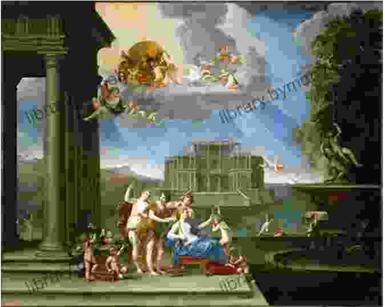
The Toilet of Venus 1755-1760