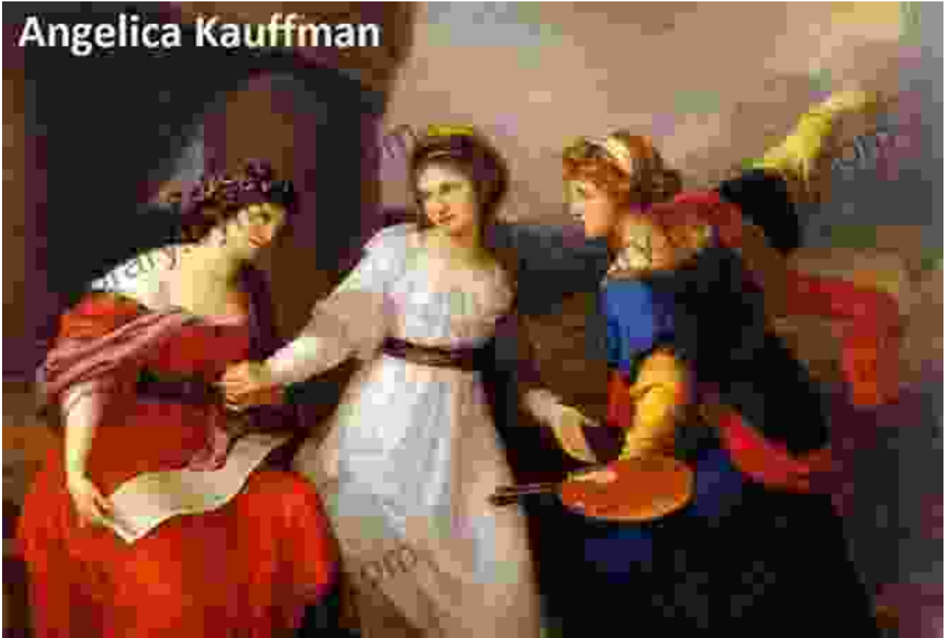
Venus and Cupid