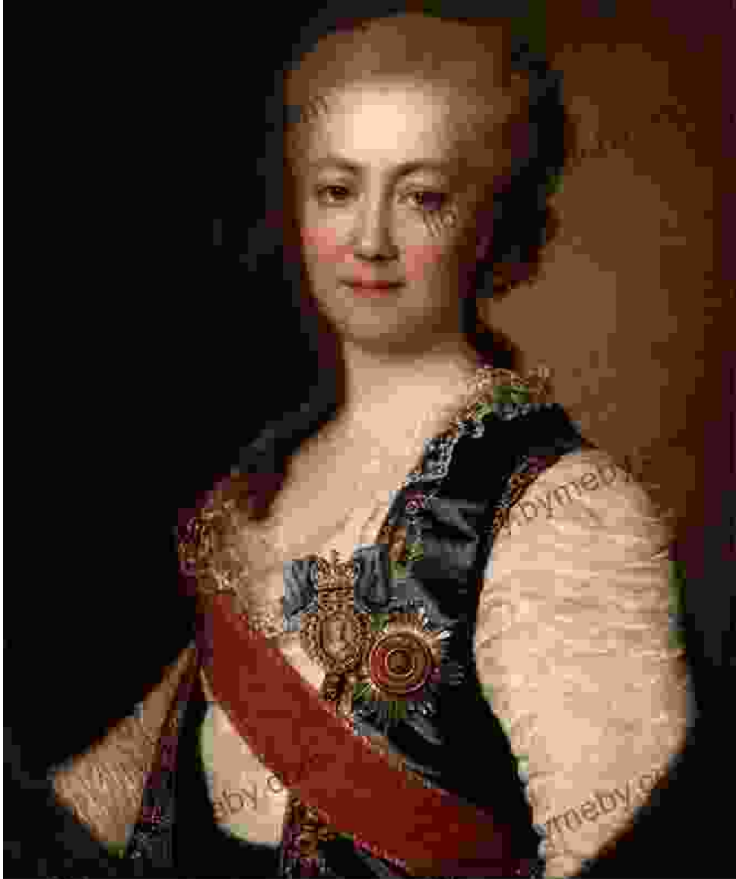
Portrait of Catherine the Great 1781-1782

These 56 color paintings provide a comprehensive overview of Angelica Kauffman's oeuvre, showcasing the range and depth of her talent. From ethereal portraits to grand historical scenes, each painting reveals the artist's mastery of color, composition, and storytelling.